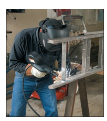
Great For Projects or Repair

Our low-priced spool gun is your most reliable aluminum feeding solution.