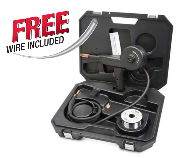
Complete Kit. No bulky module required. Order K2532-1