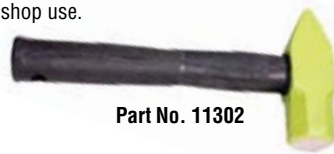
Part No. 11302