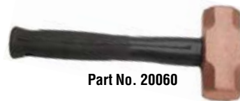
Part No. 20060