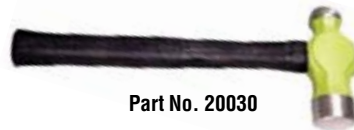
Part No. 20030