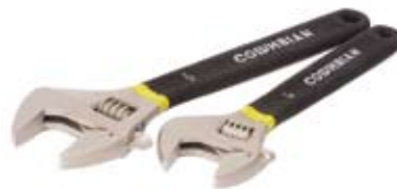
Part No. 30425