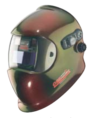
Part No. K604- Cosmic Copper