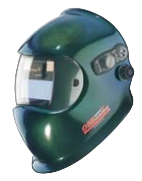
Part No. K575