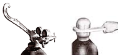
Part No. 1027

Combination wrench 9" long has a total of 10 openings from 7/16" to 1-1/8" including a boxed opening for B and MC acetylene valves and a socket for commercial acetylene cylinders.