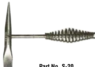
Part No. S-20