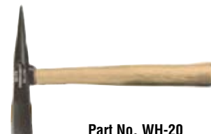
Part No. WH-20