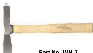
Part No. WH-7

Part No. 0026 - 13" Wood handle and wedge for long neck