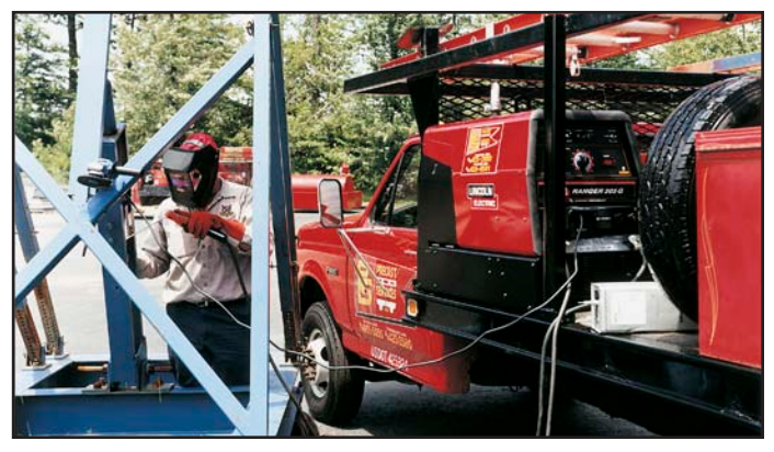
Make the Ranger<sup>®</sup> 305 G your portable welding station – general stick and downhill pipe, Touch Start TIG<sup>®</sup>, MIG, flux-cored and AC generator to power lights, grinders or other power tools.