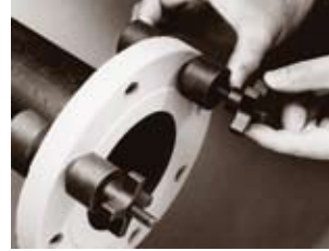
Part No. QAFP (Mild Steel)