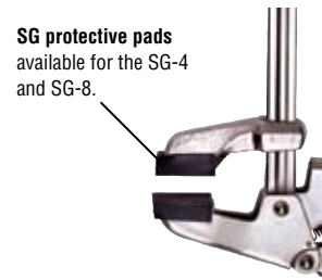
SG protective pads available for the SG-4 and SG-8.