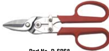
Part No. D-SPS8