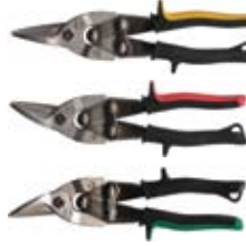
Set of three in vinyl pouch Part No. DAV3P-BE