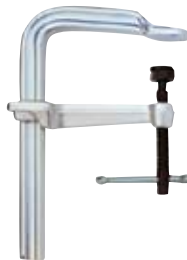
Part No. 7200 Series