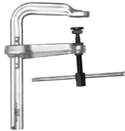
Part No. 1800 Series