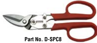
Part No. D-SPC8