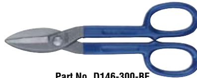
Part No. D146-300-BE